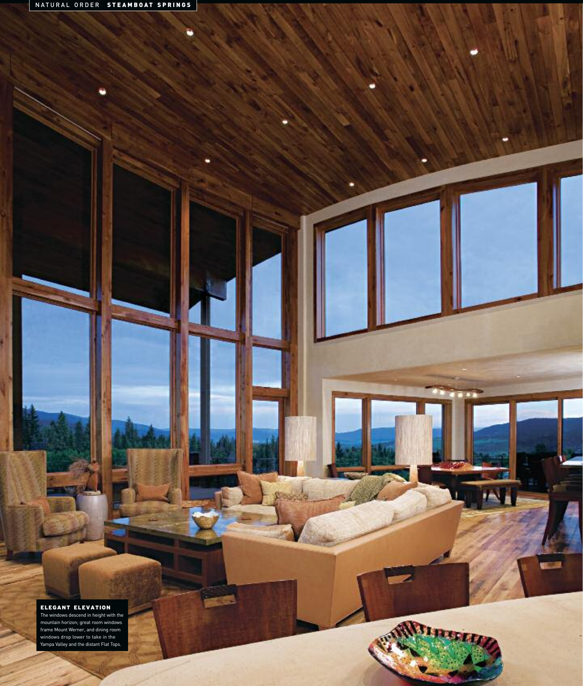
ELEGANT ELEVATION The windows descend in height with the mountain horizon; great room windows frame Mount Werner, and dining room windows drop lower to take in the Yampa Valley and the distant Flat Tops.